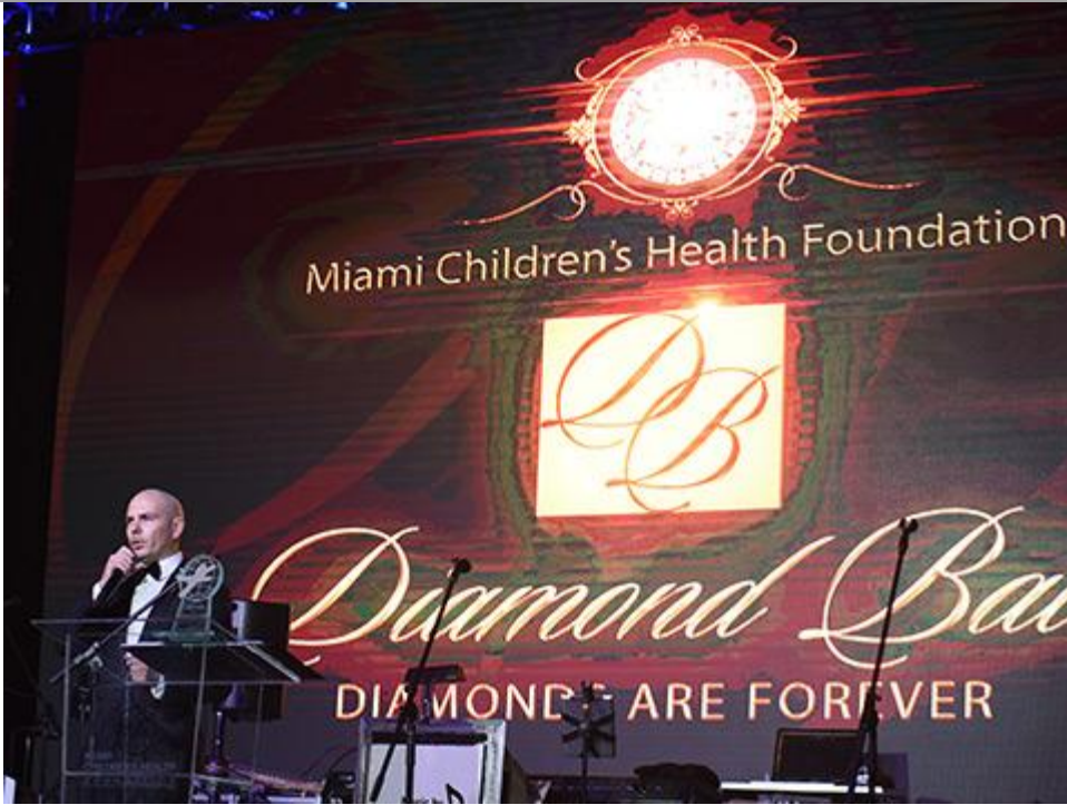
Armando Christian Perez receiving the Award