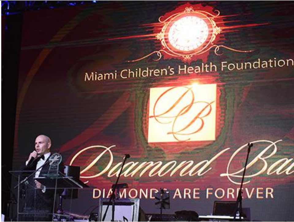
Armando Christian Perez receiving the Award