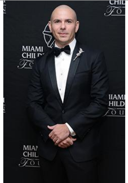
Armando Christian Perez